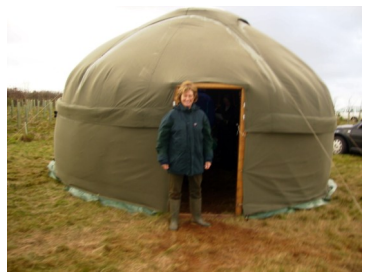
Linda and the Yurt

PS Someone left a purple folding umbrella after the tree planting day. If that was you, please call 881070 to retrieve it as it is missing you.