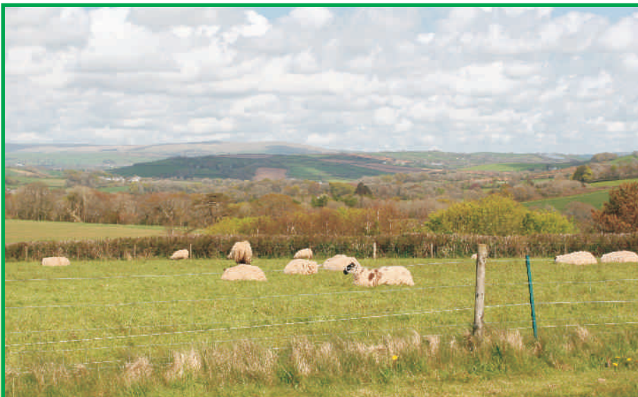
A view to the north with Dartmoor in the distance

memorial tree and members who join the Association during their lifetime pay reduced charges. Grave plots are located in groves with the position carefully charted so they can be easily located by future visitors. Note: we do not record where ashes are buried or scattered in our woodland areas but, to allow a precise record to be kept, those of two or more family members may be interred in a grave plot. Plots are allocated at the time of burial or may be reserved alongside that of a family member.