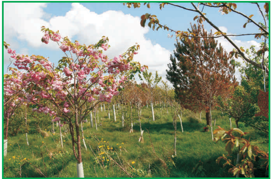
Cherry blossom at springtime

memorial tree and members who join the Association during their lifetime pay reduced charges.